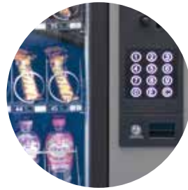
An elegant and uncluttered design