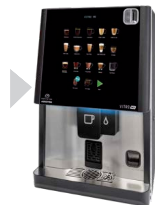
External MDB payment module