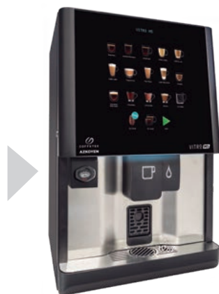
MDB cashless system integration kit

For stand-alone operation, the Vitro M5 allows the inclusion of a cashless system or a separate change giver pod. In addition, it is compatible with the Pay4Vend application that allows payment to be made directly from a mobile phone.